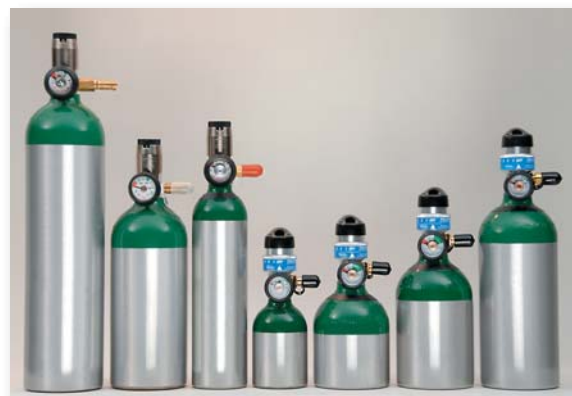
MD M9 M6 M2 ML4 ML6 ML9